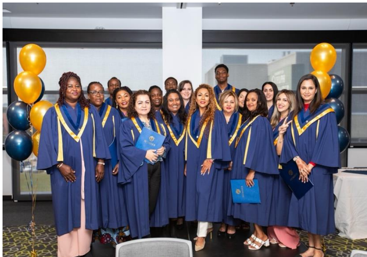
On the left, the 2024 Humber Academic Upgrading Program Graduation

Academic Upgrading graduates may also be eligible for scholarships and awards once they enter into their post-secondary programs. For a list of these awards and the criteria for application, please visit: http://www.humber.ca/studentawards/