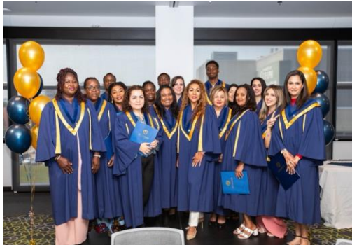
On the left, the 2024 Humber Academic Upgrading Program Graduation

Academic Upgrading graduates may also be eligible for scholarships and awards once they enter into their post-secondary programs. For a list of these awards and the criteria for application, please visit: http://www.humber.ca/studentawards/