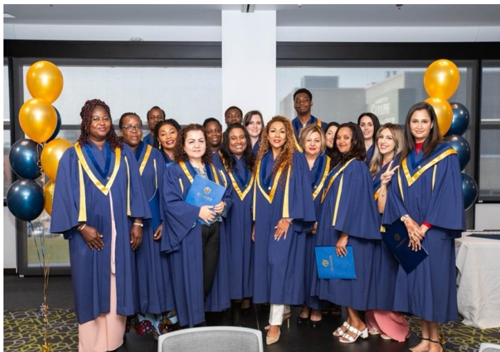
On the left, the 2024 Humber Academic Upgrading Program Graduation

Academic Upgrading graduates may also be eligible for scholarships and awards once they enter into their post-secondary programs. For a list of these awards and the criteria for application, please visit: http://www.humber.ca/studentawards/